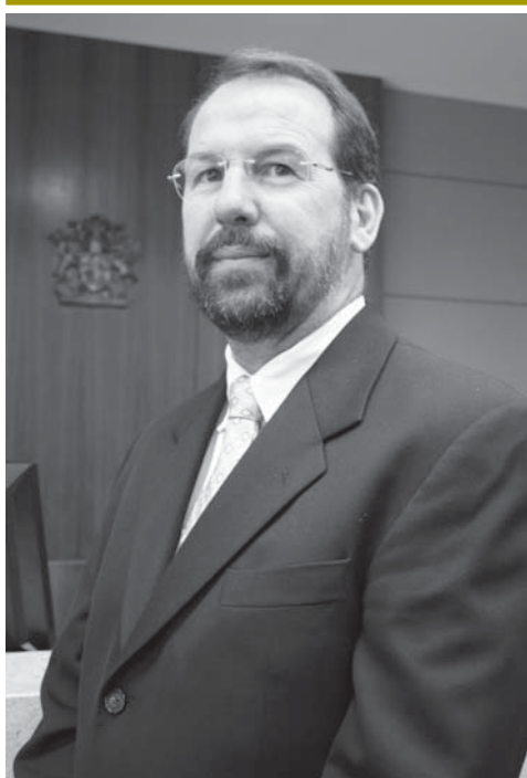
Michael Barnes State Coroner

The modernisation of the coronial system which commenced with the introduction of the Coroners Act 2003 continued throughout 2006–07. This has led to a number of significant changes to the way coroners operate compared to the system that prevailed under the Coroners Act 1958 .