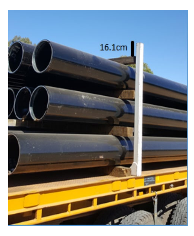
Image 1: Pipes, separating wood blocks and stanchions – note the top (fourth) row had been removed in this photograph