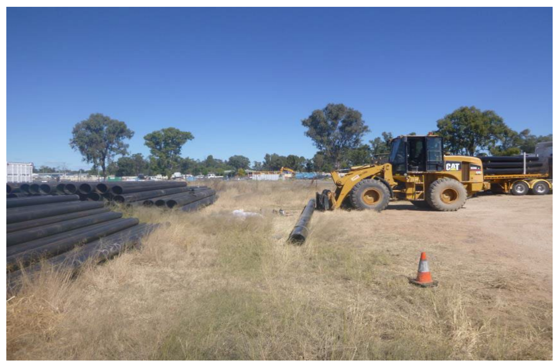
Image 2 depicts the Front-End Loader with the pipe on the tynes that was lifted from the deceased's body. (The truck had been moved.) On the left is the pile of pipes that were 1.5 metres from the flatbed trailer.