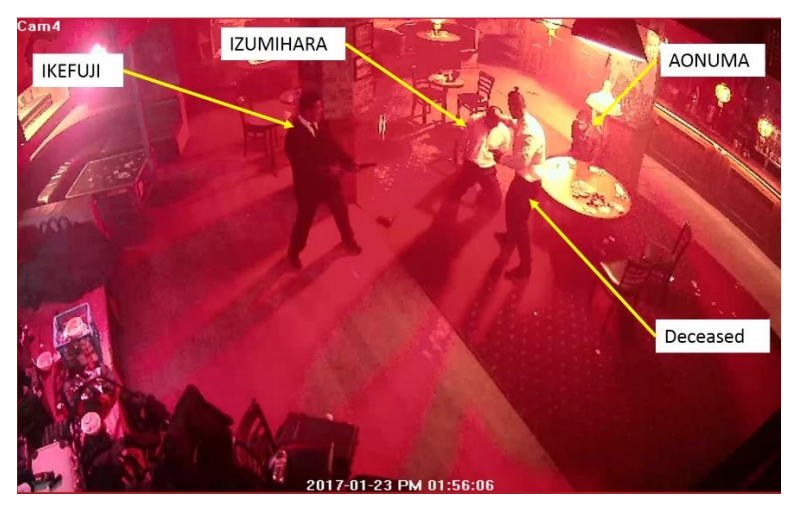
Brooklyn Standard CCTV